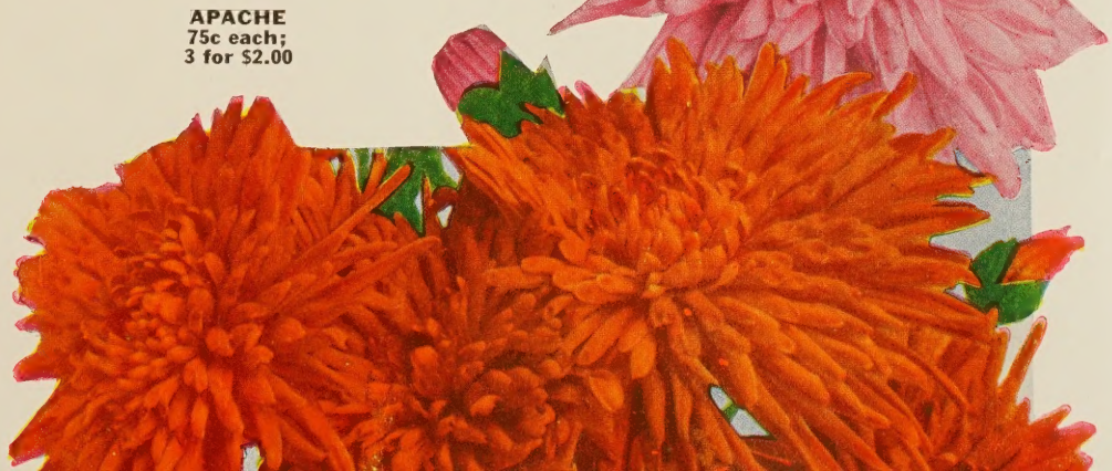
APACHE 75c each; 3 for $2.00